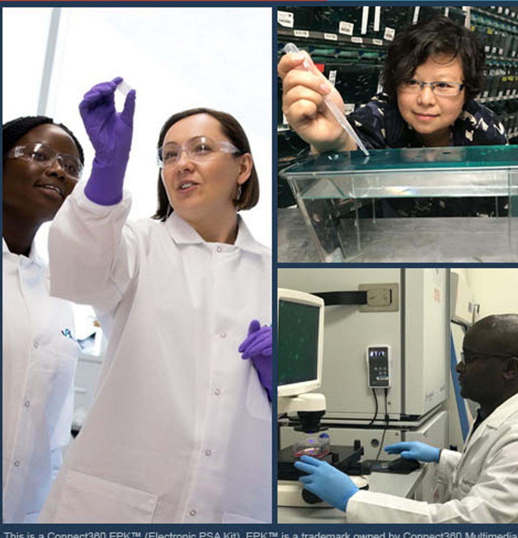
This is a Connect360 EPK™ (Electronic PSA Kit). EPK™ is a trademark owned by Connect360 Multimedia.